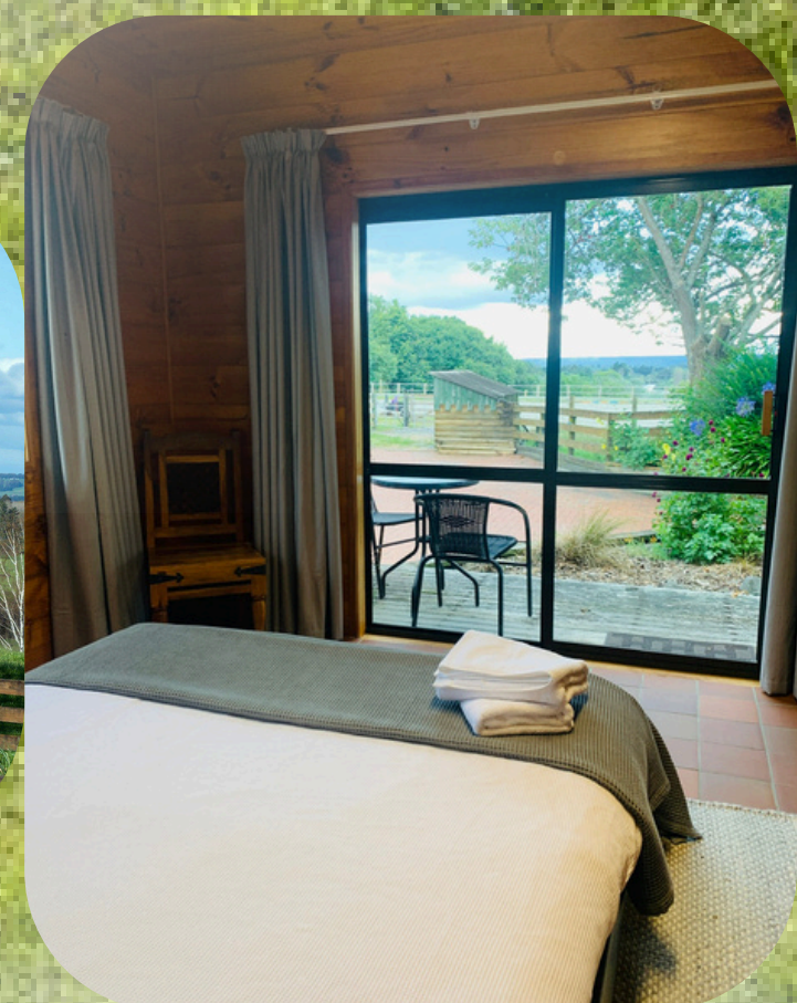
Comfy Facilities Private Room-1