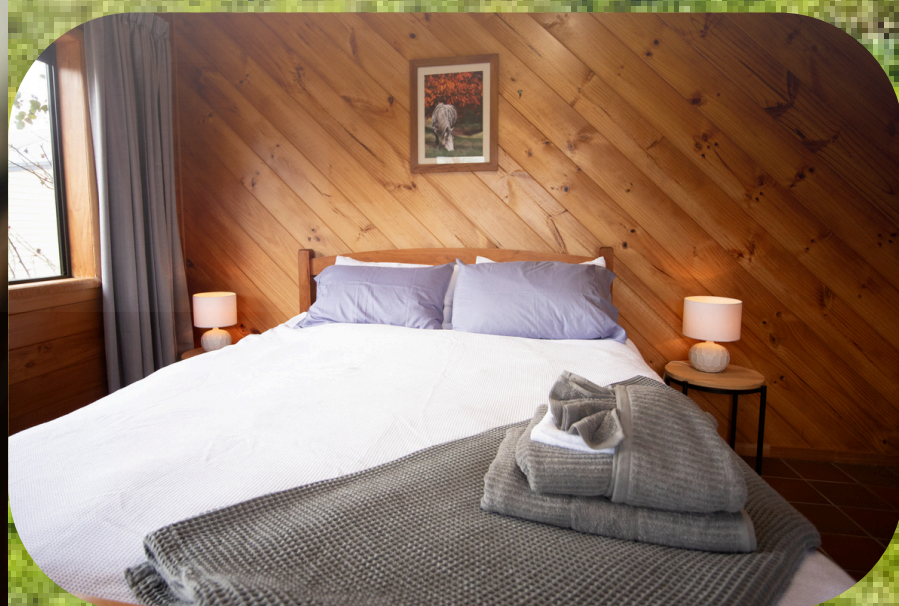
Private Room - 1