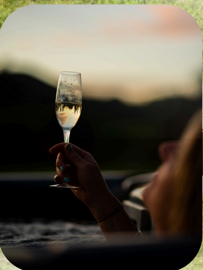
Relax in the Spa